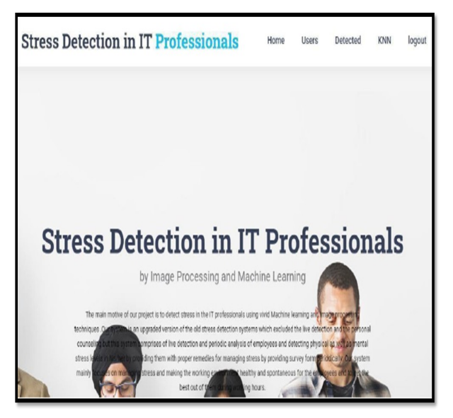
Figure 3: Stress Detection page