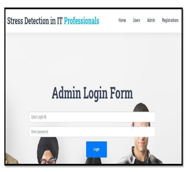
Figure 2: Admin Page