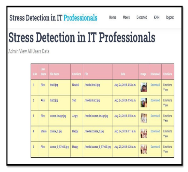
Figure 3: Stress Detection Page