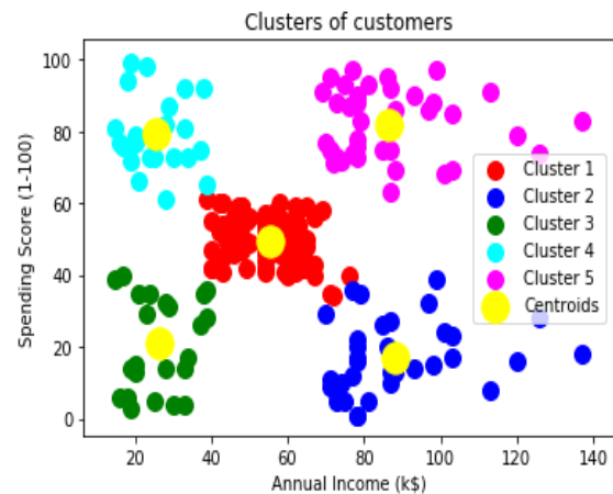
Figure 2: Clusters of Customers

This indicates the analysis of datasets after selection of Optimized Centroid from the datasets including five clusters of customers with respect to spending score and annual income of customers as shown below: