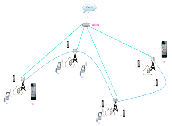
Figure 3.1: Ad-hoc Cloudlet Network

Each cloudlet is able to establish a connection with other cloudlet using the Adhoc On Demand Distance Vector (AODV) routing protocol in this architecture. The cloudlets are capable to provide the services to the mobile devices as per their requirement even when the mobile devices are moving from one network to other network. Figure 3.1 shows the components of the cloudlet network.