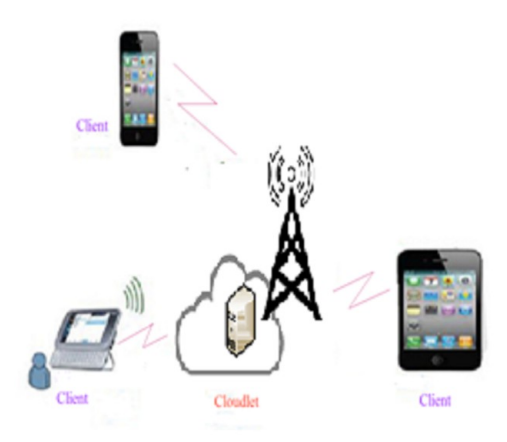
Figure 1: Insecure Data Transfer Between Cloudlet and Mobile Devices

When the mobile device gets connected to the nearby cloudlet, it offloads its data to the cloudlet to perform the tasks when such kind of requirement occurs. Since the mobile device has limited resource availability, the mobile device gets benefit of the cloudlet. The mobile device will get the result of the task performed even when it goes out of range of the current cloudlet network. But, there is lack of data transfer security. So, the security in data transmission has to be achieved.