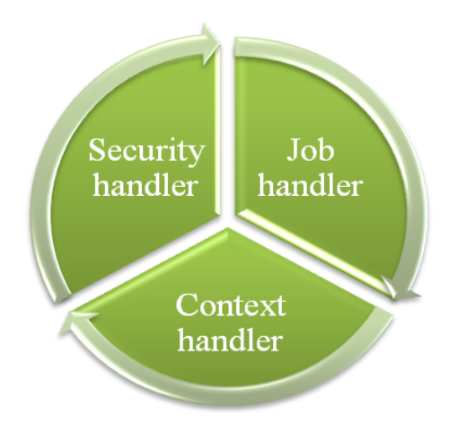
Figure 4.1: Additional Components of the Cloudlet.

There are three additional components of the cloudlet have been assumed: Security handler, job handler, and context handler as in Figure 4.1. Since the main focus is on the secure data transfer issue in mobile cloud computing model, this model is based on the security handler part with respect to other components' benefits.