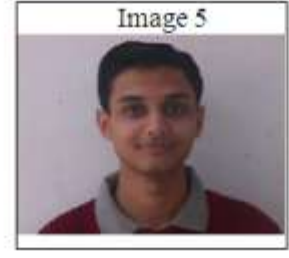
Figure 2. Illustrating examples of input images from the Indian Face Database.