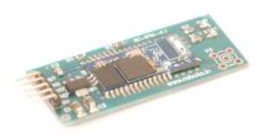
Figure 3 :Bluetooth module

technology called frequency hopping spread spectrum, where data transmitted is chopped into chunks, which are transmitted on up to 79 bands, each with a bandwidth of 1 MHz centered from 2402MHz to 2480MHz. Equations