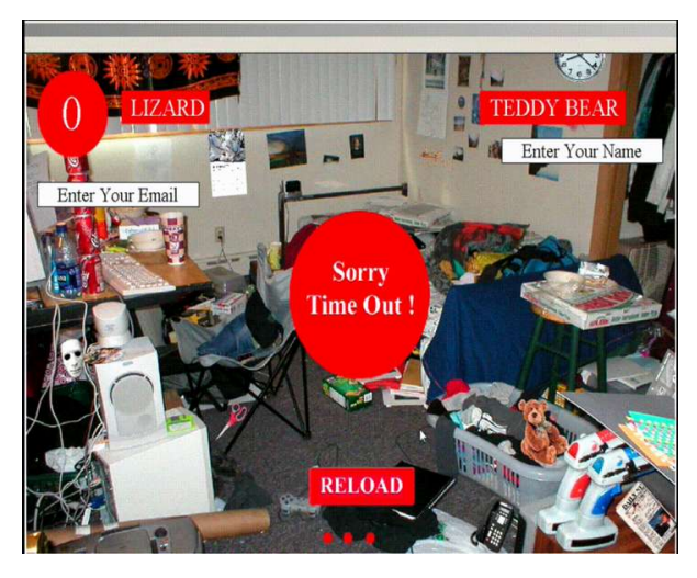
Figure 5. CAPTCHA Reload Option