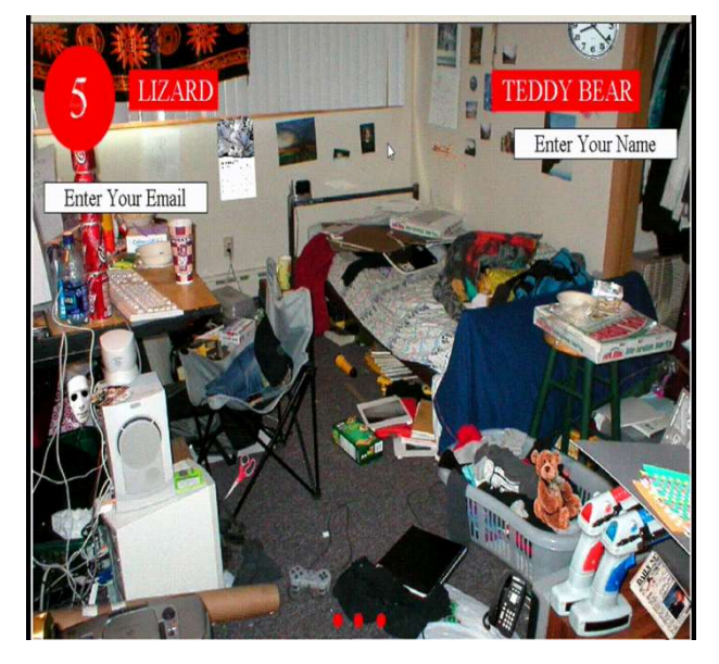
Figure 4. Open fields in CAPTCHA