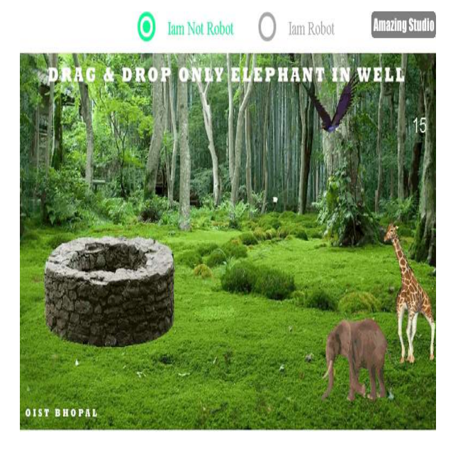
Figure 3. Drag and Drop Gaming CAPTCHA

In that considered CAPTCHA technique, object used to drop is elephant and the target used is well on which the object is to drop. Both the object and the target can be easily recognized by the technique of image processing. Dragging to the entire position of the frame will solve the CAPTCHA within few seconds.