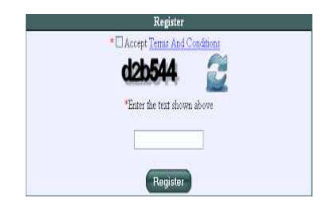
Figure 1. Text CAPTCHA

Those tests may contain some JPEG or GIF images because robots are able to recognize the presence of an image by examine the source programming but can't identify what that image represents or depicts. Even some of the image CAPTCHAs is so tough to read by the user. In those cases, generally users have the option to ask for a new one. As shown in figure 1, system asked to write those mismanaged text in the given box to prove their identity. It's a type of text CAPTCHA.