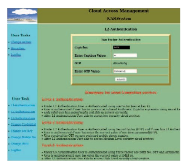
Figure 2: User authentication System(CAM)